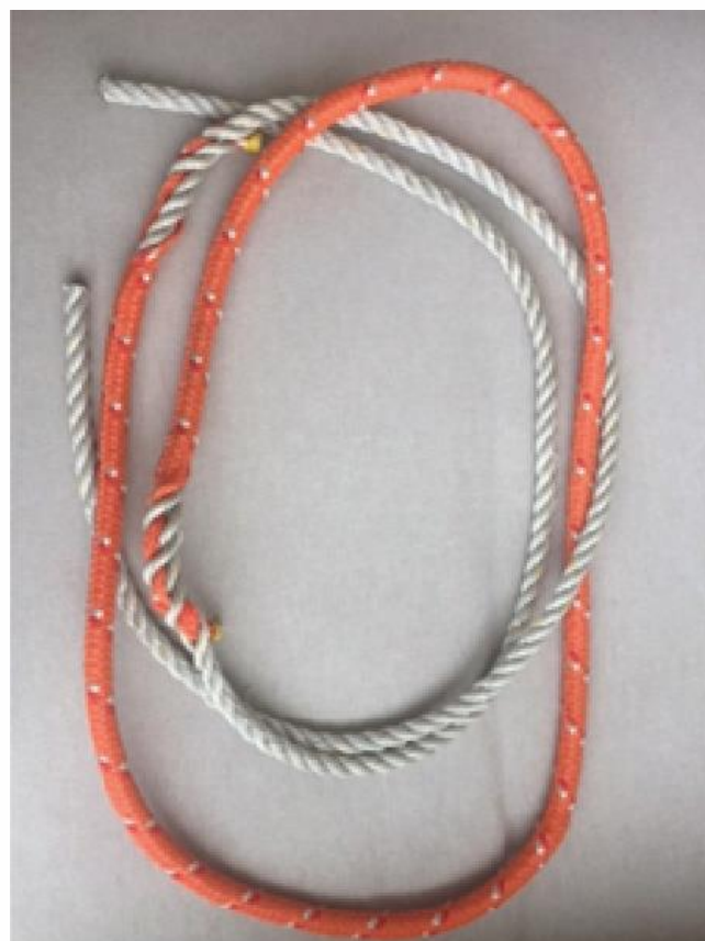
Figure 1. A sample 6-foot-long section of braided sleeve encasing 3/8 inch buoy line. The hollow ends of the sleeve are spliced into the rope fibres.

Weak links in a buoy line could compromise normal fishing operations, possibly leading to gear loss. In particular, they may lose their functionality in high tide conditions. Currently produced sleeves are limited to gear configurations that haul gear using rope up to and including 1/2 inch diameter. To date, attempts to make a sleeve for rope 9/16 inch or larger, that breaks consistently below 1,700 lb, have not been successful. However, segments of 1/2 inch rope and sleeve could be spliced into 9/16 inch or larger rope.