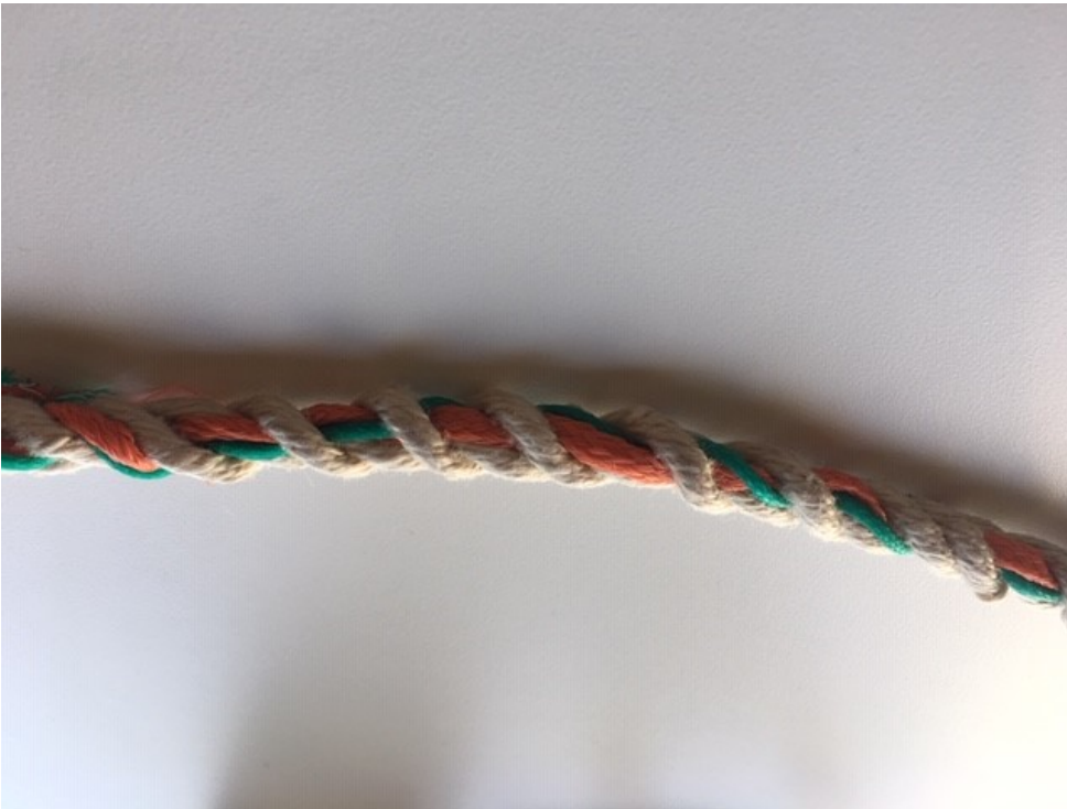
Figure B - Colour combo identifying Region, Species and Fishing Area Region & species interlaced on same section of rope, Fishing area on subsequent section of rope as per colour scheme this would be Quebec (green), snow crab (orange), CFA 12A (green)